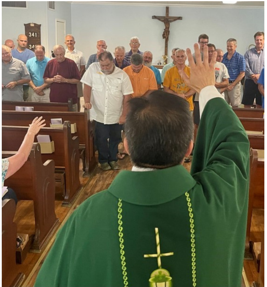
Father's Day Blessing at St. Rosalie