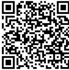
Holy Cross Communication Update